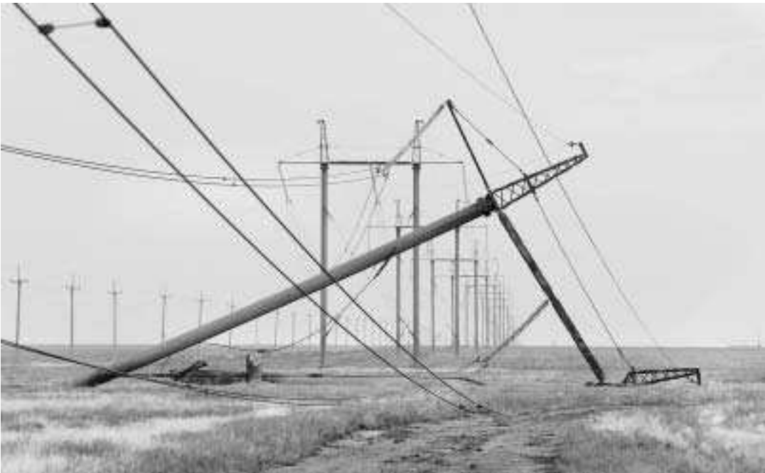
A damaged electric pylon near the village of Chonhar in the Kherson region on Monday. The main power lines in southern Ukraine that supply Crimea were knocked down by saboteurs.