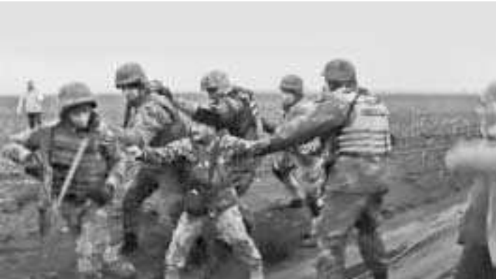
An activist, center, tried over the weekend to hinder Ukrainian forces deployed to the site where electric pylons were damaged.